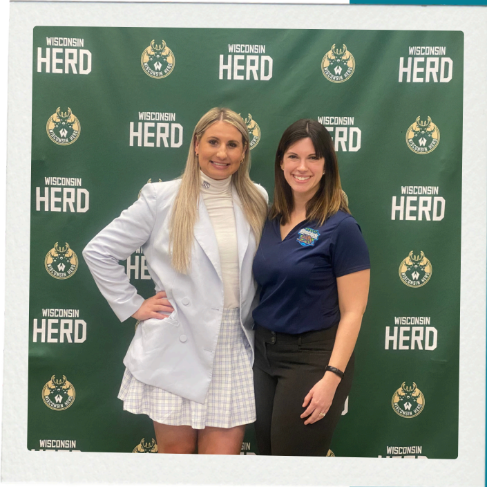
WISHING mentors at Wisconsin HERD's Women Empowerment Weekend.